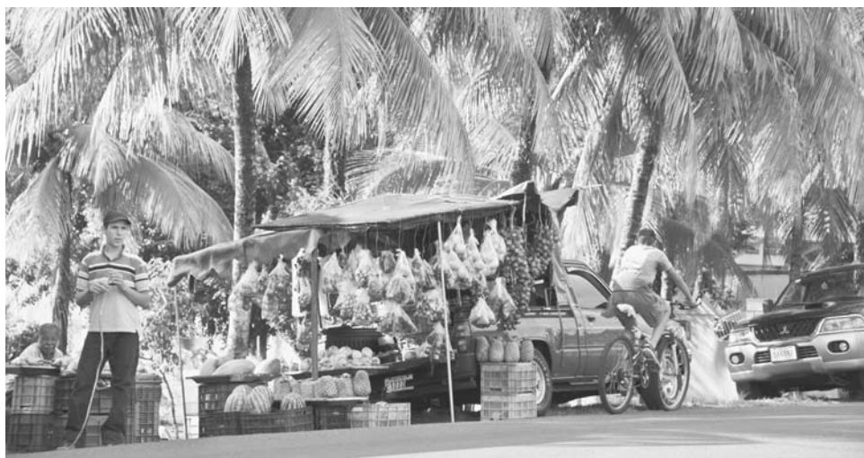
A roadside fruit stall displays a variety of tropical fruits, such as papayas, pineapples, watermelons, mangoes and other fruit wrapped in plastic bags in San Jose, Costa Rica.

Although small in numbers, around 350,000 people, Belize has as varied a population as any in Central America. Originally most of Belize was part of the Mayan